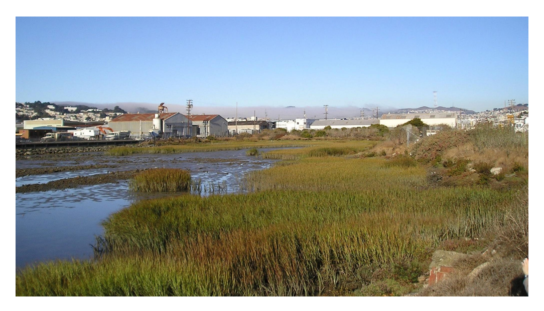
The complete tidal marsh ecosystem includes subtidal areas, tidal flats, tidal marsh, and transition zones.